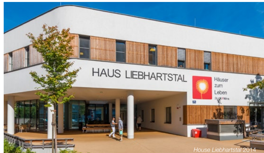
House Liebhartstal 2014